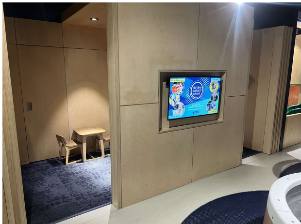
Culture Lab from outside, showing the screen outside

You will be situated in our Culture Lab room, which is located at the back of the Centre on the bottom floor – please see the map at the end of this document. This room is purpose built for both visiting researchers as well as any visitors requiring a quiet/private space.