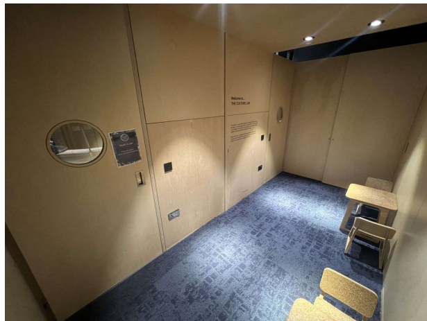
Inside Culture Lab, with the doors shut